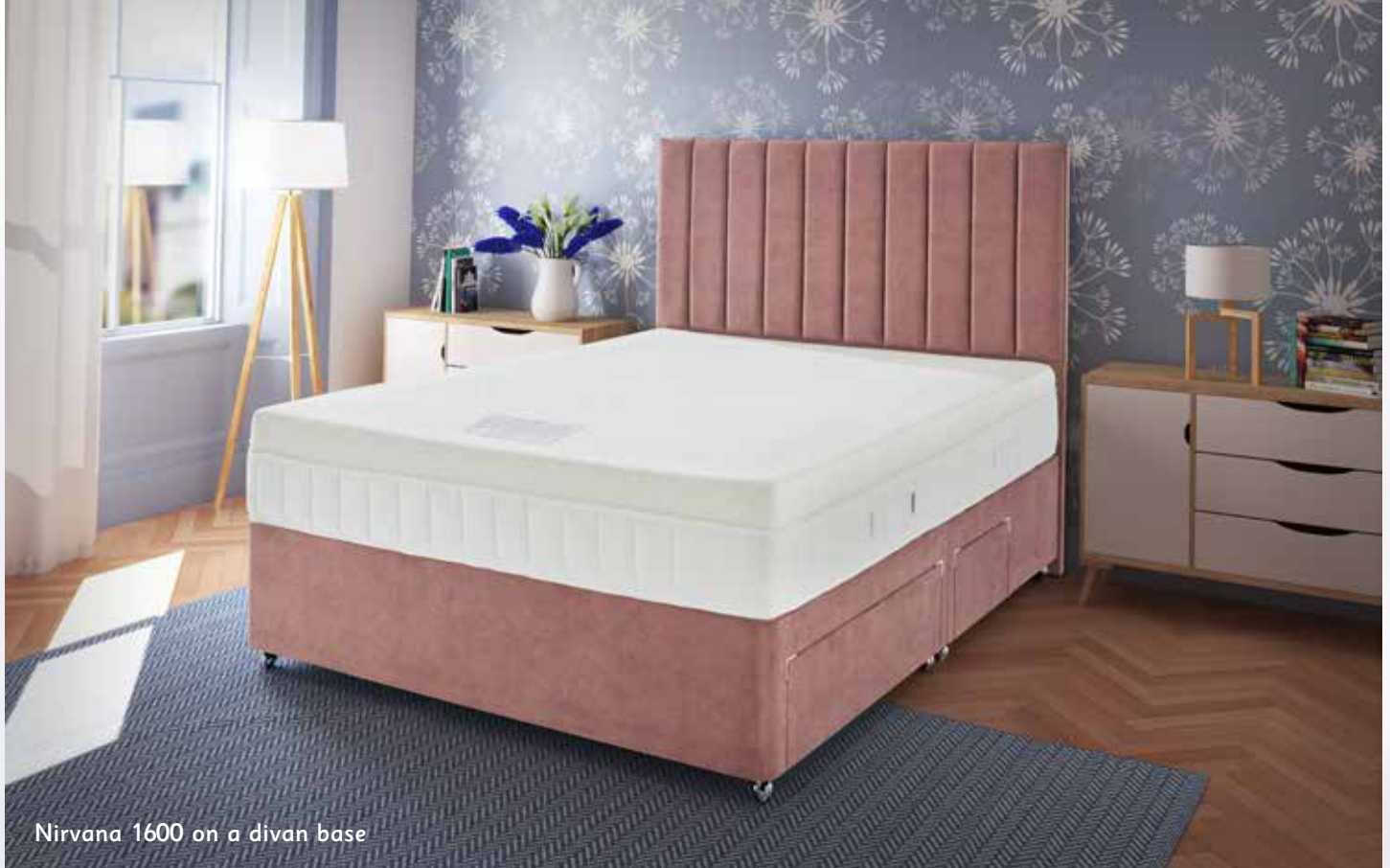
Nirvana 1600 on a divan base

Equivalent of 1600 pocketed springs in a king-size mattress. Available as a firm edge pocket divan set or firm edge pocket base on tapered legs set