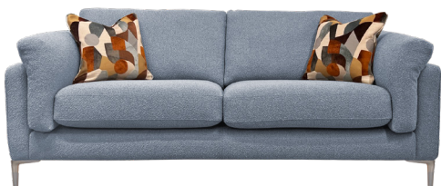
W- 213cm H- 90cm D- 97cm