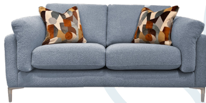
W- 188cm H- 90cm D- 97cm