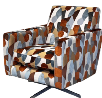
W- 74cm H- 94cm D- 94cm