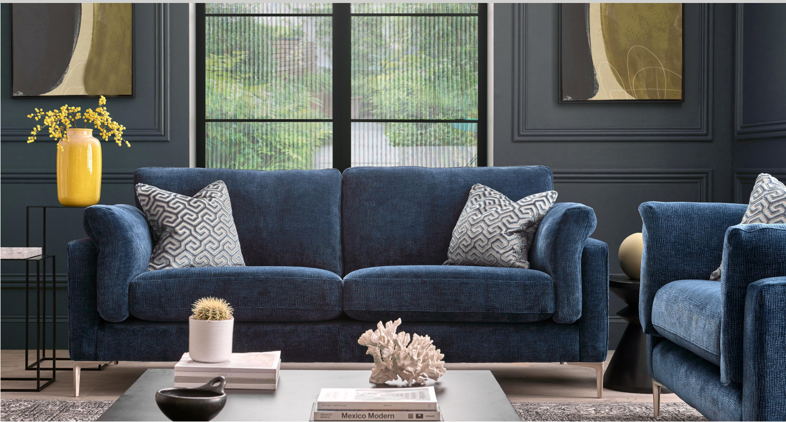
Image shows 3 Seater Monika and Cuddler in Exclusive Marine with Contempo Marine Scatters and Brushed Chrome feet