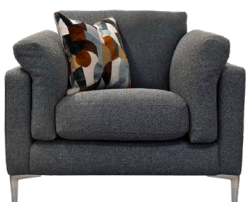
W- 99cm H- 90cm D- 97cm