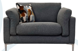
W- 131cm H- 90cm D- 97cm