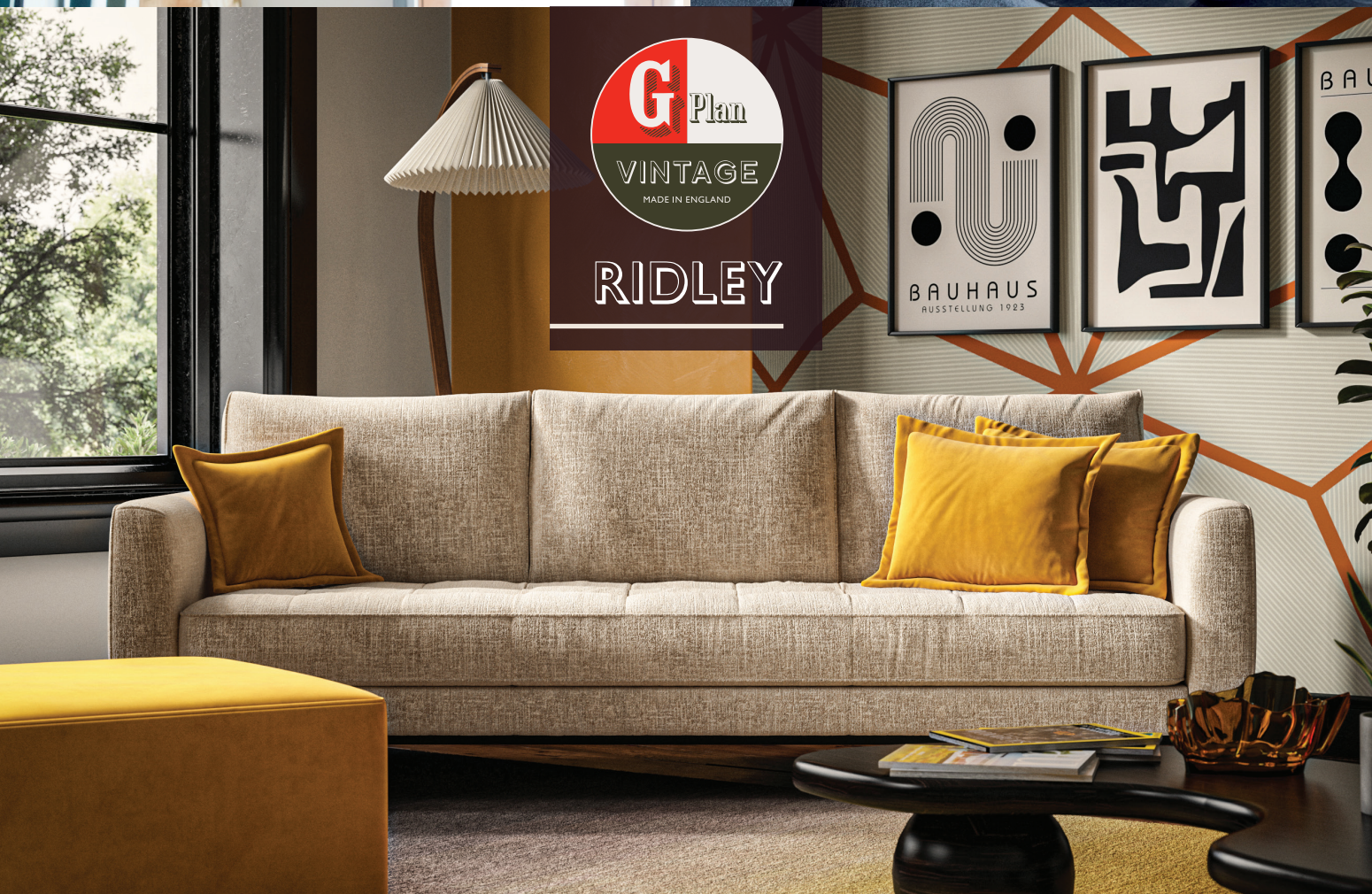
Cover Photo shown in: Grand Sofa shown in Linea Balm, Shakespeare Footstool shown in Plush Turmeric.