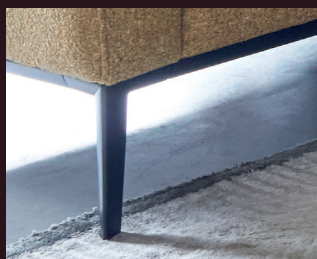
Metal Plinth Option

Slim, sleek, and sophisticated. Ridley's clean lines, beautiful piping, and distinctive pulled seat detailing offer a contemporary and yet timeless design style. Taking inspiration from mid-century furniture, Ridley will add a touch of vintage charm to any room. With the option of selecting our Two Fabric Story, you can make Ridley even more eye-catching than it already is. Ridley can be customised even further, with the option of adding either more traditional wooden feet or a more contemporary metal plinth, to fully fit into your domestic setting style.