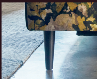
Wooden Leg Option